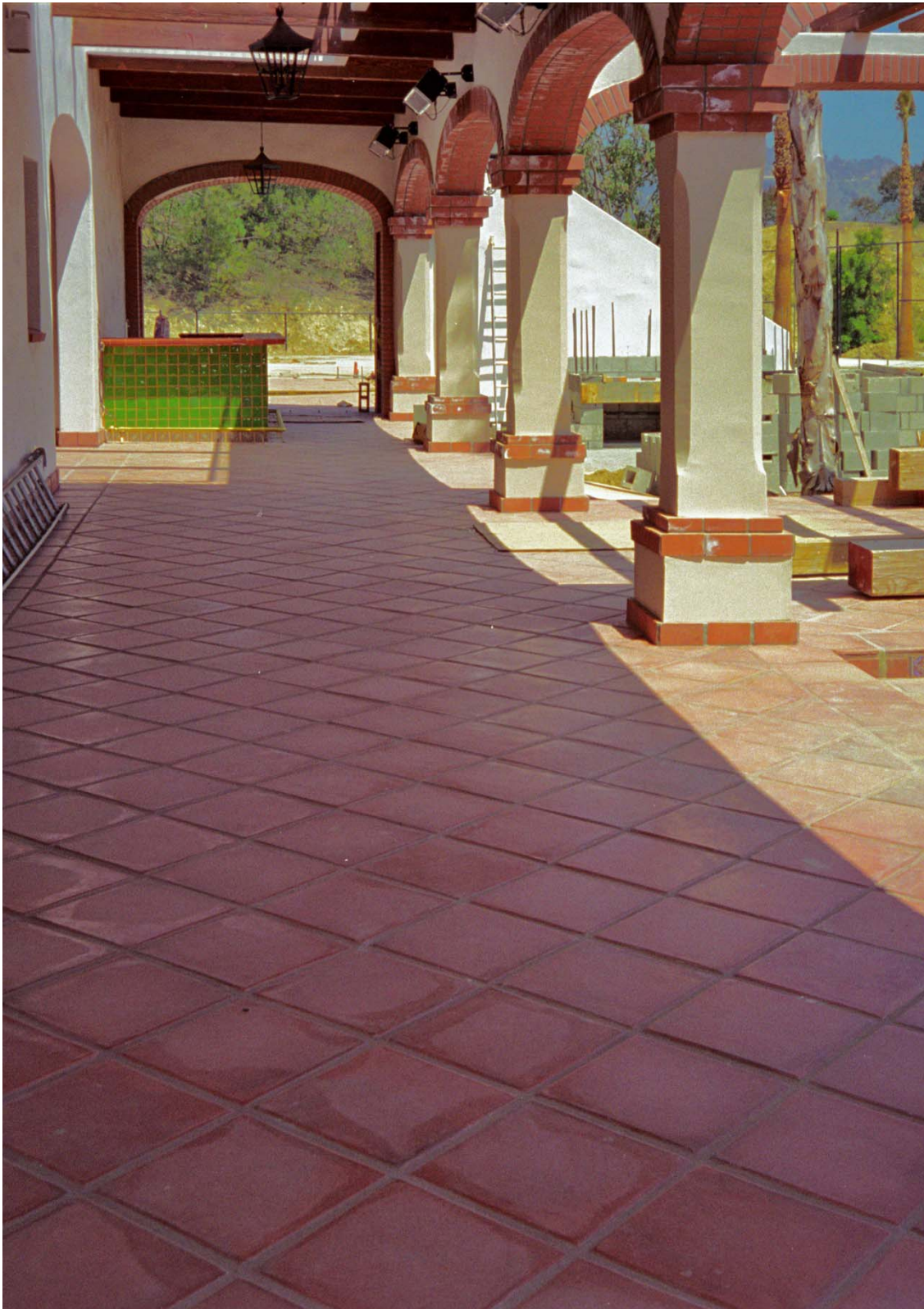
Super Saltillo 16x16, Sedona Red, Residential Colonnade, Beverly Park, CA